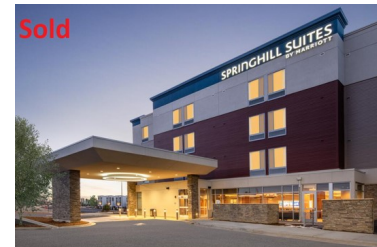
Parker, Colorado - 108 Rooms

7. Unmatched support provided to network brokers from the AMHB corporate office to help close the sale.